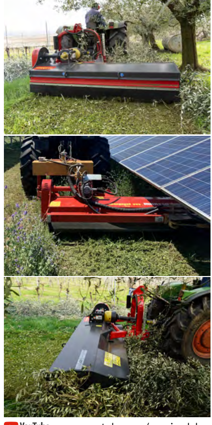
▶ YouTube www.youtube.com/seppimulcher